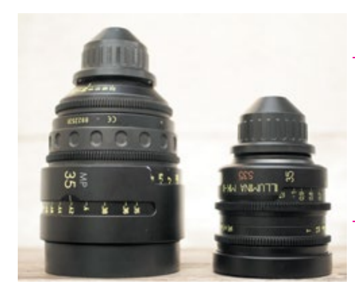
Pic 3 Zeiss Master Prime 35mm and Illumina MK-II 35mm

_Illumina lens prototypes first saw the light of day in 2009 at the NAB show in Las Vegas. They hit the shelves for public sale one vear later. Initially on offer from Luma Tech were lenses with 18mm. 25mm, 35mm, 50mm, and 85mm focal lengths. Then came a 135, and recently a 14 as well. They all have a T1.3 aperture minimum, except for the 14 and 135mm lenses, on which the "full aperture" is set to T1.8. The new lenses are marked as MKII. This is how Luma Tech has designated the ones produced after 2011. At that time the LOMO factory purchased new machinery and chose a team of workers, which deals exclusively with lenses. They introduced a modification that reduced internal friction in the focus mechanism.